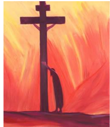
Illustration by Elizabeth Wang, 'Leaning on the Cross' © Radiant Light, www.radiantlight.org.uk

Whether in specific or broad terms, seeking the