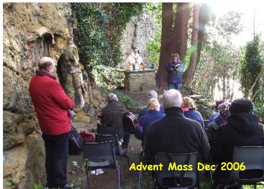
Advent Mass Dec 2006

The group was set up in March 1997 when a St Mary's parishioner, who had looked after the chapel personally, left the area. We had a partnership with the